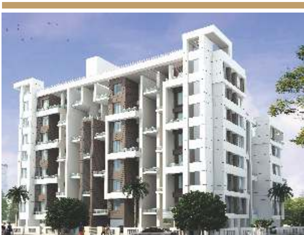
Kanchanban A Landmark Recreated ! 2 & 3 BHK Terrace Flats S. B. Road

A luxurious residential project situated on the SB road, featuring latest amenities and top-notch specifications. This residential scheme comprises 2, 3 & 4 BHK apartments.