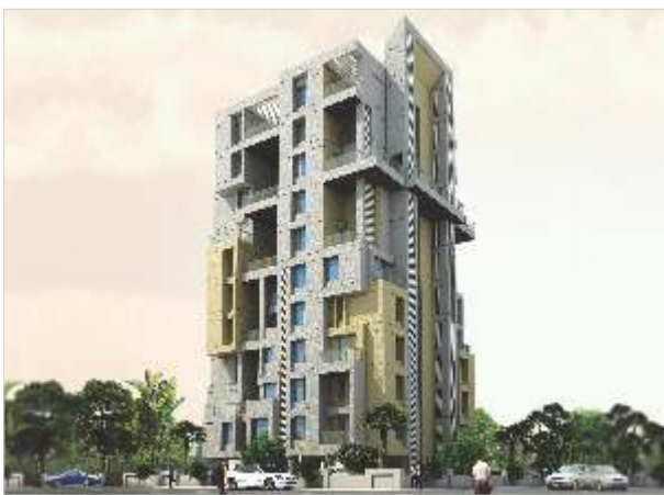
SUNIT Anant 3&4 BHK FLATS @ KOREGAON PARK

Located on the bustling commercial corridor on Senapati Bapat Road, Sunit Capital is undoubtedly a prime business destination. It houses 23 offices and 5 showrooms tailor-made to take your business to the next level.